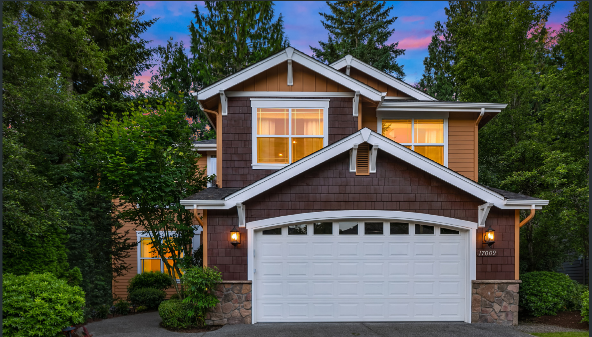
EDUCATION HILL Grayson at Abbey Road by Burnstead

Impeccable home in quiet cul-de-sac, backing to serene nature preserve